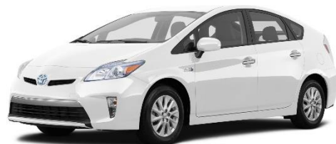
Figure 3: 2019 Toyota Prius

The ICE is very important in modern century to provide a source of power to drive our vehicles. The first stage, intake draws in air and fuel into the combustion chamber. The second stage, compression. Where the piston moves up compressing the air and fuel. The third stage is power where the sparkplug ignites the air and fuel causing the piston to go back down. The final stage is exhaust where gasses leaves the engine through the exhaust pipe and the cycle will repeat itself again. Over the last decades, advancements in research and development has helped manufacturers reduce ICE emissions of dangerous pollutants, such as nitrogen oxides into the atmosphere. The research helped increase the ICE's horsepower but also have a good efficiency. Helping manufacturers maintain or increase fuel economy.